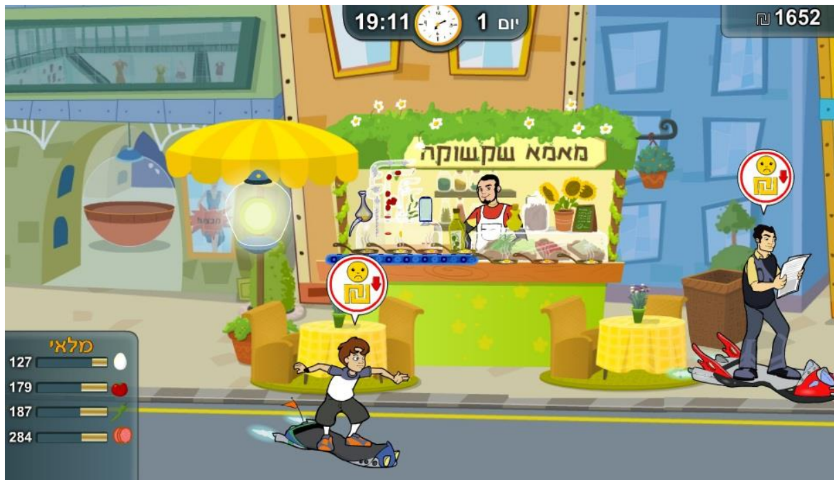
Figure 2. Customer feedback in the Shakshouka Restaurant game. The money earned appears in the top right corner. The speech bubbles above the customers provide feedback that the price should be lower. The panel on the bottom left corner indicates the remaining stock.