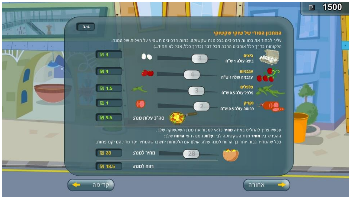
Figure 1. Setting ingredients and price in the Shakshouka Restaurant game. Text translation:

the shakshouka recipe and price in order to increase their profits. The challenge of the game is finding the right balance between all of these components, that is producing the shakshouka at a reasonable cost and selling it at a price that meets market expectations and provides an optimal profit.